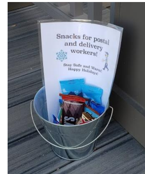
On a Proctor porch