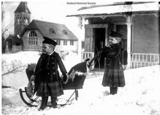
Twin Boys with Sled, Proctor Union Church in Background